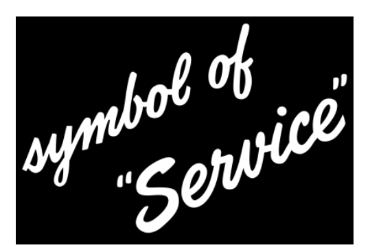
66" wide "Symbol of Service" slogan was used through the '50s until 1960.

In the '50s and '60s, as with many roads, marketing slogans were applied to the sides of cars to act as rolling billboards.